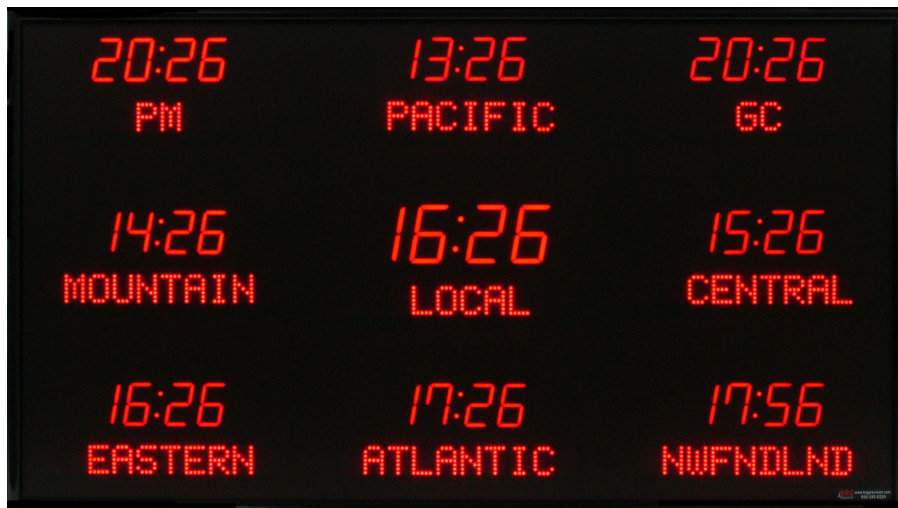
Model 6615A - 1.8" & 2.5" time, 10 character - 1.2" zone labels, 9 zones

The 6615 series time zone clocks have 9 user changeable multi-color bar-segment LED time displays with ten character user changeable multi-color dot matrix digital zone labels displayed. The 6615 models can display up to 18 time zones through page flipping. For example, the 6615A & B can show two pages of time zone information.