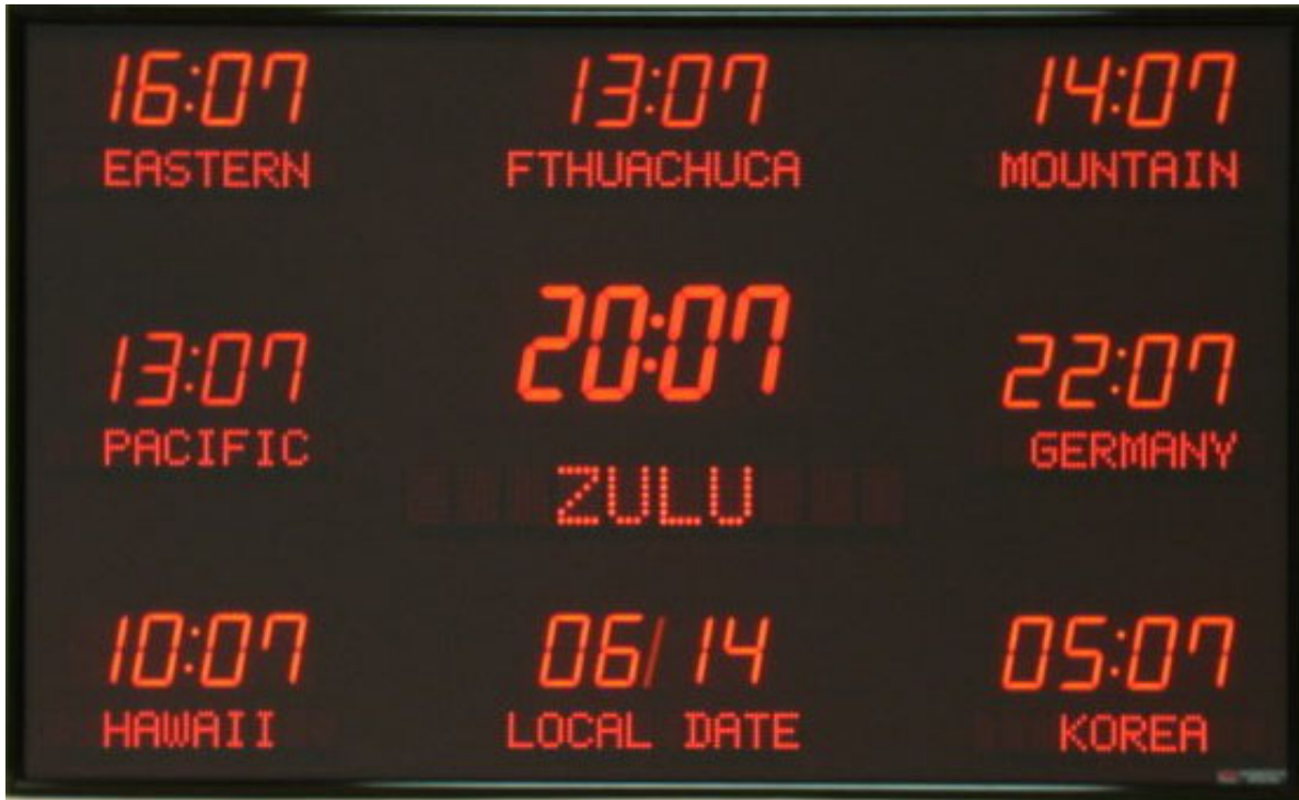
Model 6615B - 2.5" & 4.5" time, 10 character - 1.2" & 2.0" zone labels, 9 zones